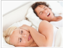
Snoring Can Kill - Stop It Tonight