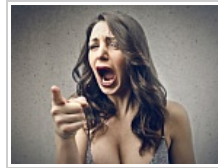
Mission Viejo arrest records. Who do you know? [Results could be shocking]