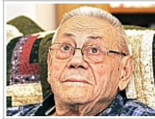
14 Benefits Most Seniors Didn't Know They Had