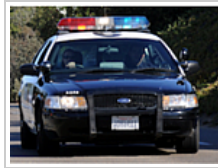
New Rule in California: Do Not Pay Your Next Car Insurance Bill Until You Read This