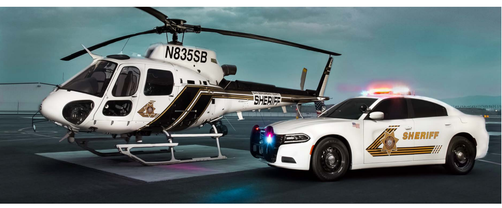
SECTION 4: CRIMINAL OPERATIONS

The Criminal Operations of the San Bernardino County Sheriff's Department plays a crucial role in maintaining public safety through a combination of strategic enforcement, specialized investigations, and rapid response capabilities. At the core of these efforts is a commitment to public trust, communication, and community engagement, made possible by our Public Affairs Division and Information Exchange programs. By fostering open dialogue with the public and ensuring accurate dissemination of information, we strengthen trust and build lasting relationships between law enforcement and the communities we serve.