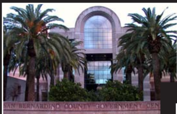
SB Government Center